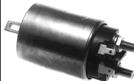
18-5809 STARTER SOLENOID

For starters with aluminum nose. Slot in end of solenoid shaft is 13/32" long. Replaces: 834520-9/BOSCH, 0331-302-050, 0331-302-081, 0331-302-085, 0331-302-581, 0331-302-585