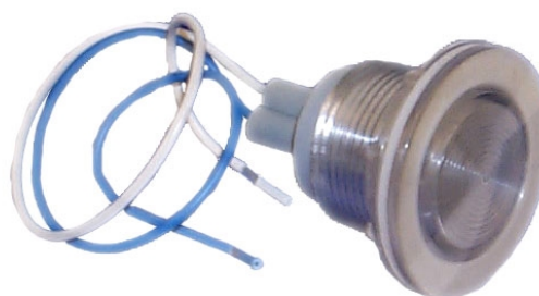
MP42402 Bait Well Light